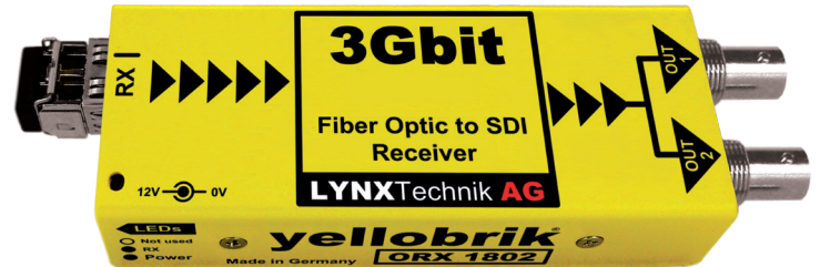
ORX 1802 LC Version Shown